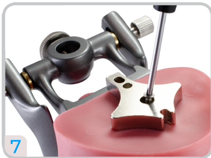
Line up the Upper Adapter Plate on the upper Carrier Tray. Fasten an M3 Screw through the center, and then an M2 Screw distally. Make sure the Adapter Plate has the countersunk side facing up.