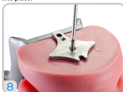
Line up the Lower Adapter Plate on the lower Carrier Tray. Fasten an M3 Screw through the center, and then an M2 Screw distally. Make sure the Adapter Plate has the countersunk side facing up.