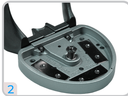
Thread an M6 screw in the center of the upper and lower Carrier Trays.