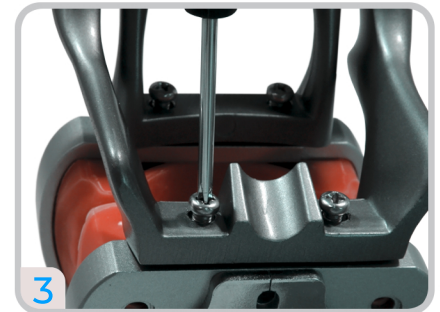
Remove all four screws that are fastened to the Carrier Trays and detach the articulator.