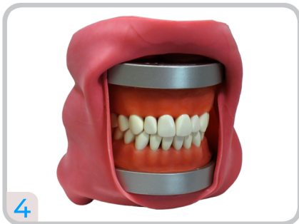
Place the Oral Cavity Cover around the Carrier Trays and position the bite correctly.