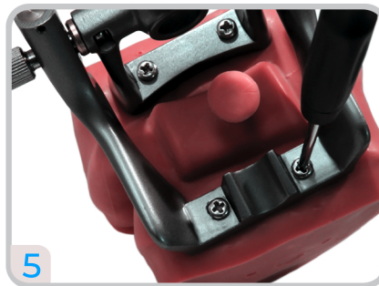
Line up the articulator with the holes on the back of the Oral Cavity Cover and Carrier Trays. Fasten all four screws back into place.