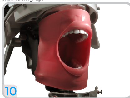
The ModuPRO is now fully attached to the manikin.

*Note: If attaching without the Oral Cavity Cover, simply attach the Darwin Plates directly to the Carrier Trays, Skipping Steps 3-6.