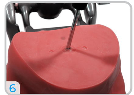
Using the screw driver, poke a small hole in the top and bottom of the Oral Cavity Cover at the indentation.